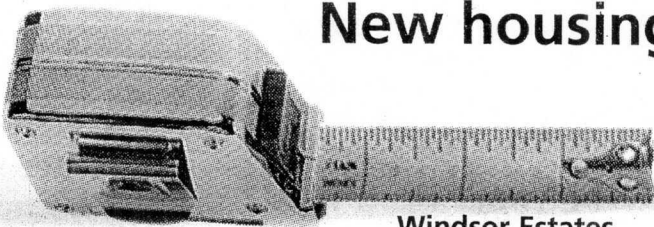
Windsor Estates 42 lots