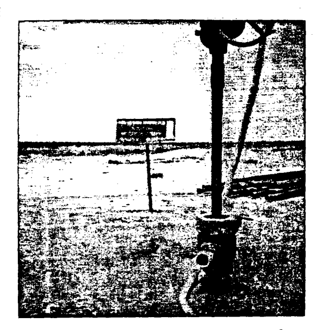
Rad Turbelover 8