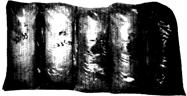
Polyethylene bags "8 in. diam. — 36 in. long"

"Strata Data" is visible on an inch by inch basis in our sample tubes and 100% samples are retained in easy to handle polyethylene bags.