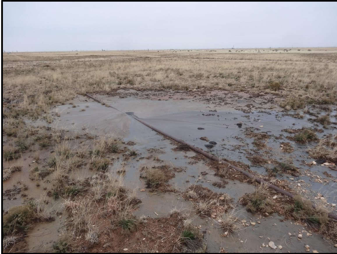
Photo Point 4: Produced water release facing east approximately. The subject steel surface line had clamps on it showing signs of previous repairs.