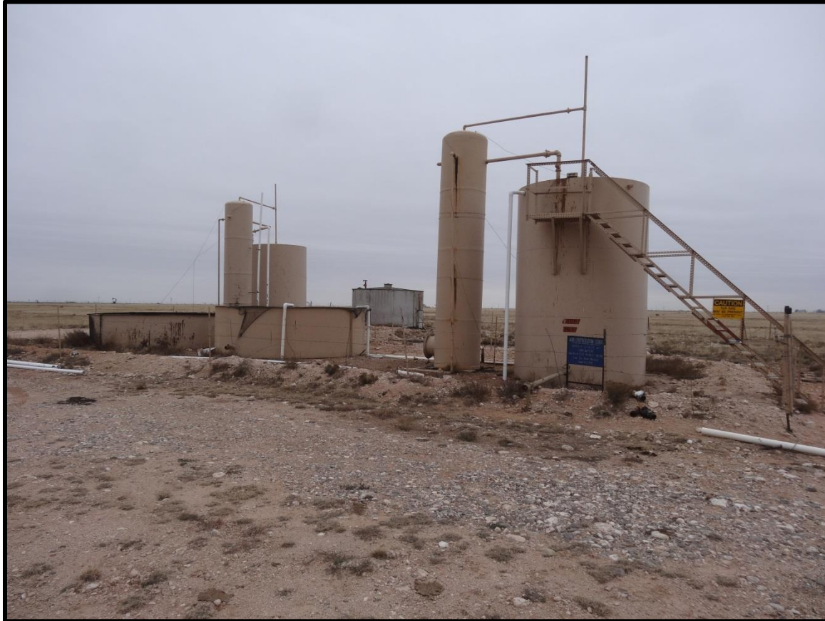
Photo Point 7: Angle State #1 Tank Battery NW4/SE4 (flow line's point of terminus).