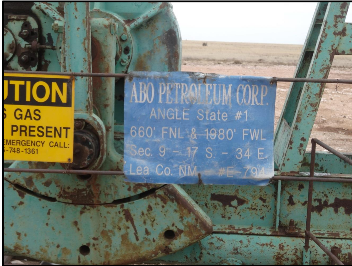
Photo Point 1: Angle State #1 Well. API Number 30-025-25347