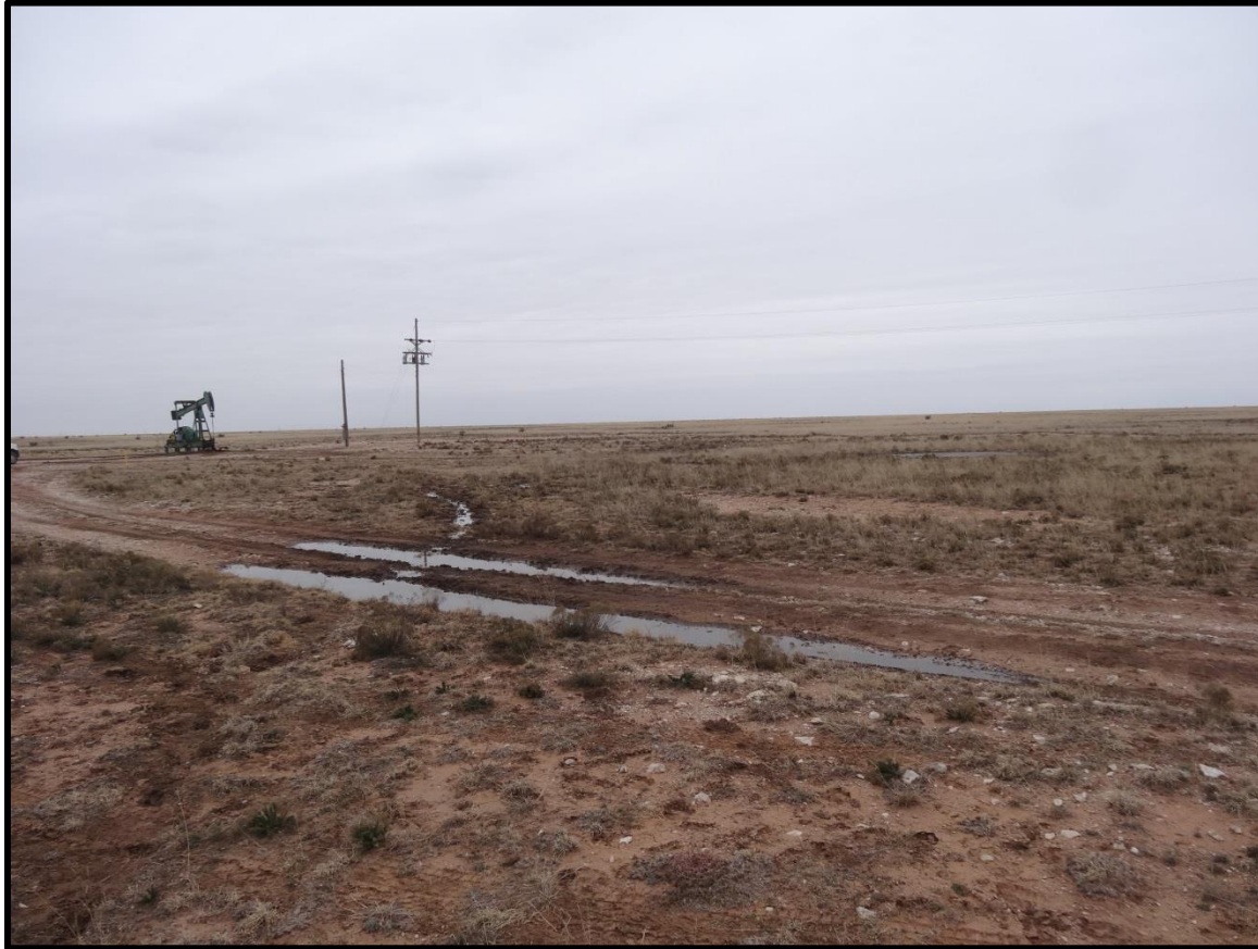
Photo Point 6: Release facing north approximately from the two track road.