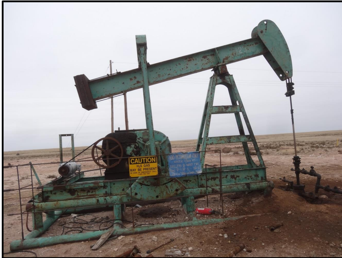
Photo Point 2: Angle State #1 well NE4/NW4 (the source of the release).