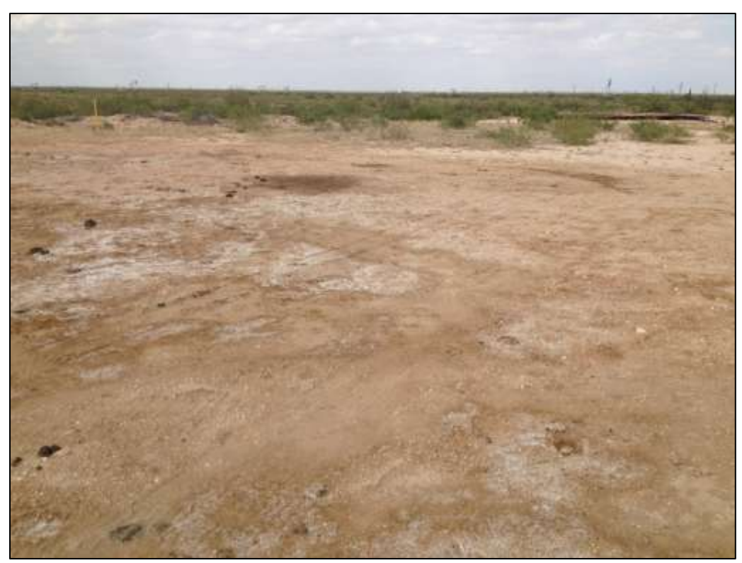
West of wellhead looking Northeast (Photo # 1)