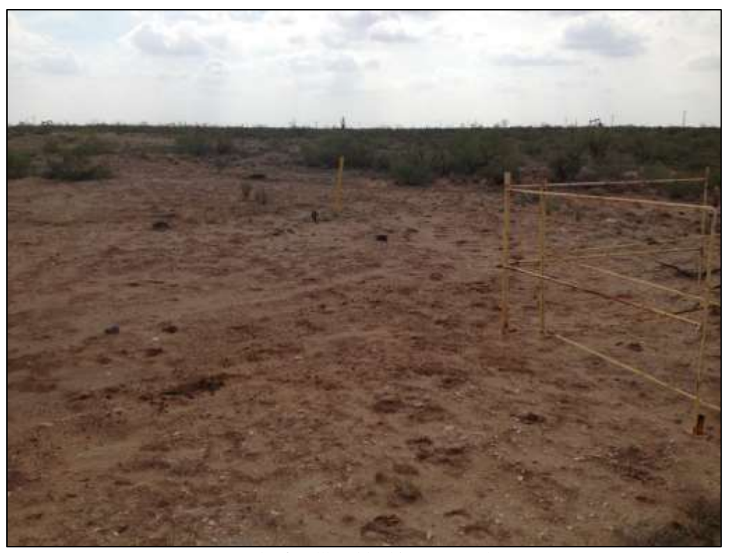
From North of wellhead looking West (Photo #7)