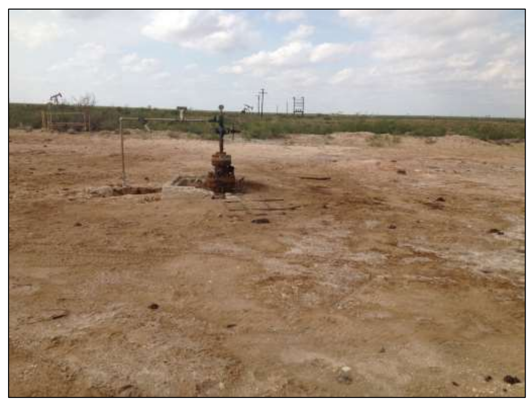
West of wellhead looking Northeast (Photo # 3)