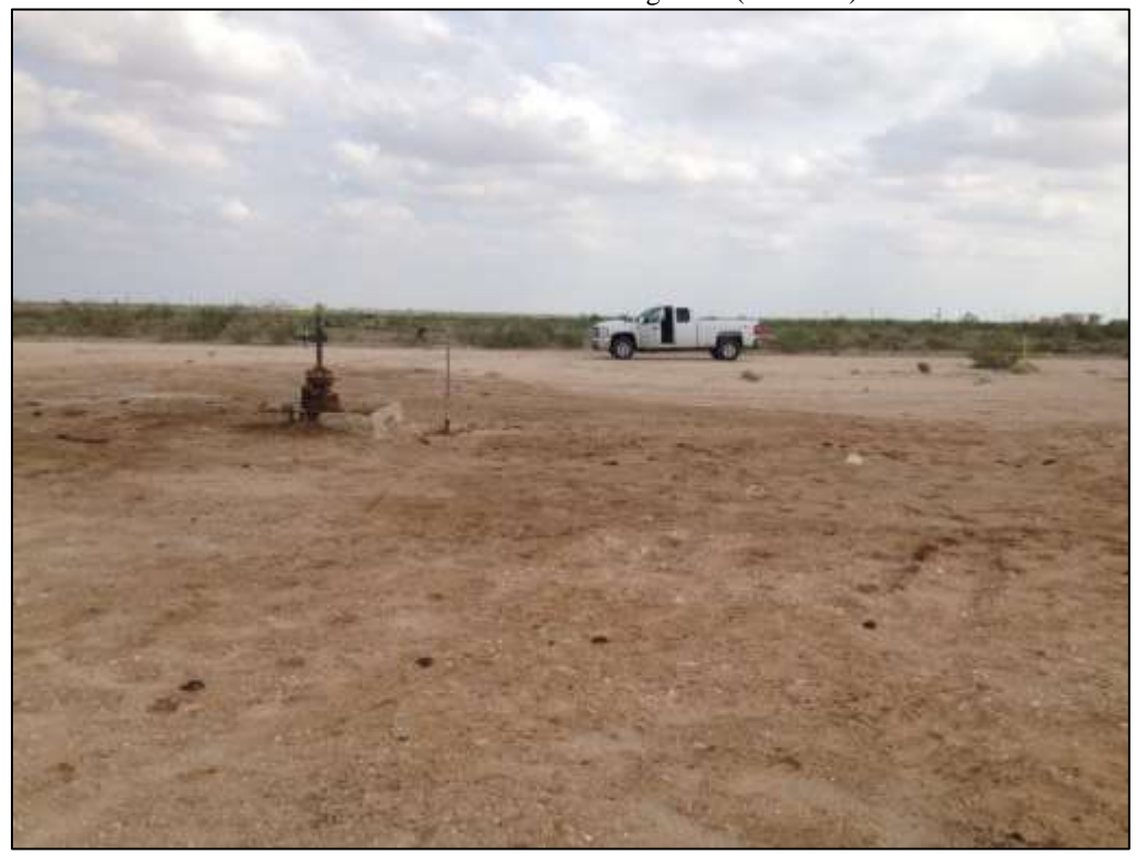
From North of wellhead looking South (Photo #8)