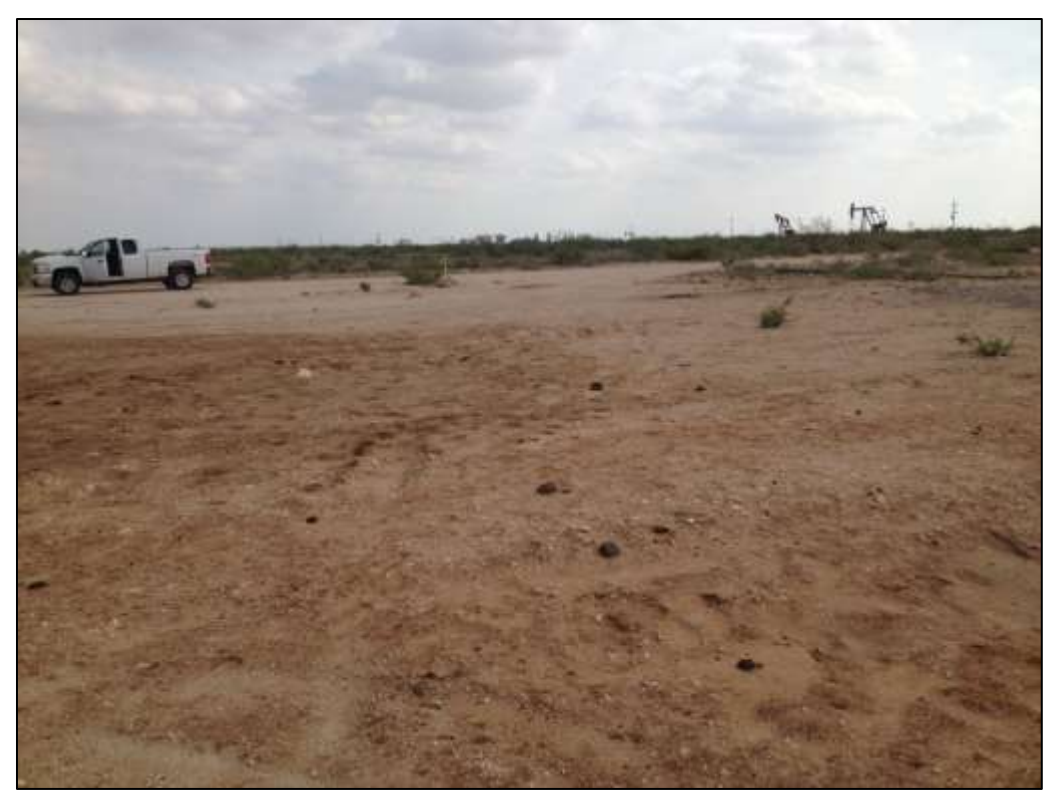
From North of wellhead looking Southwest (Photo #9)