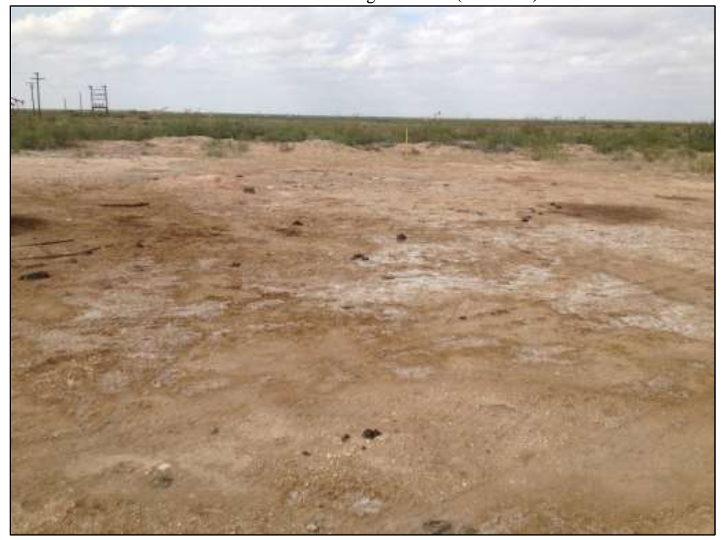
West of wellhead looking Northeast (Photo # 2)