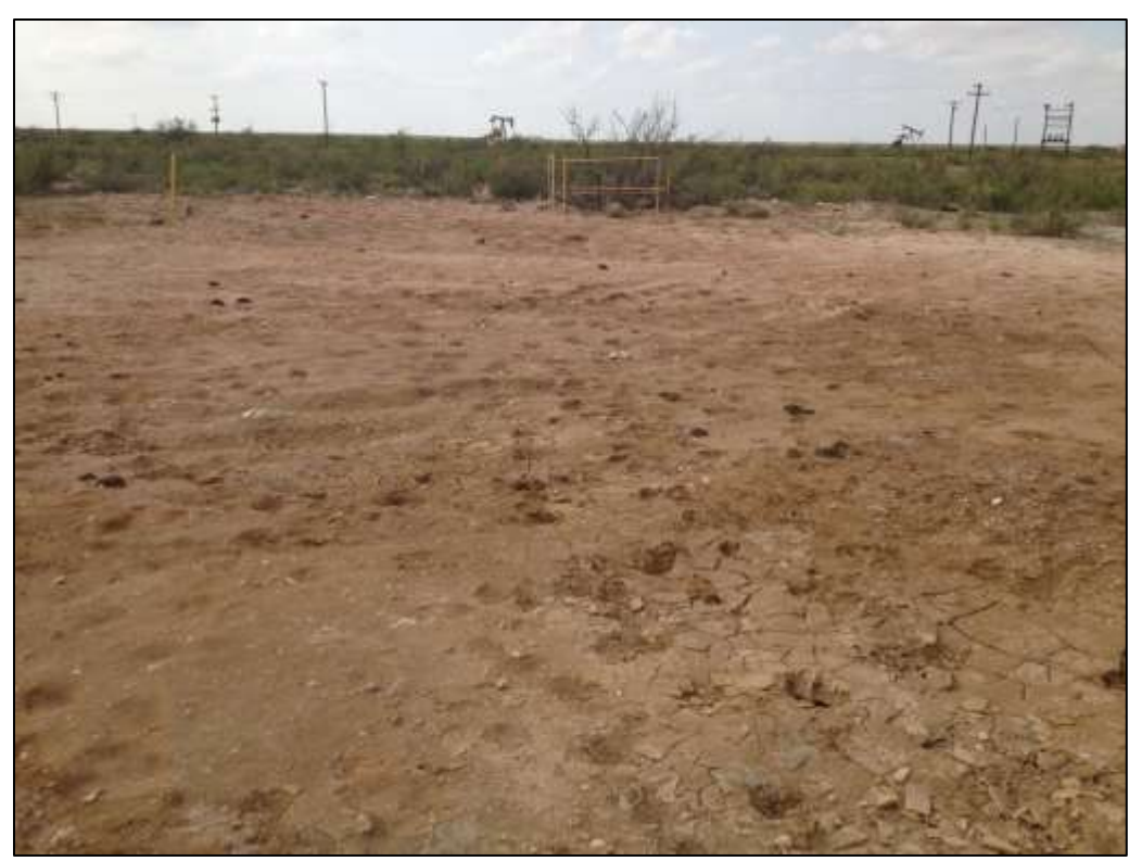
From wellhead looking Northwest (Photo # 5)