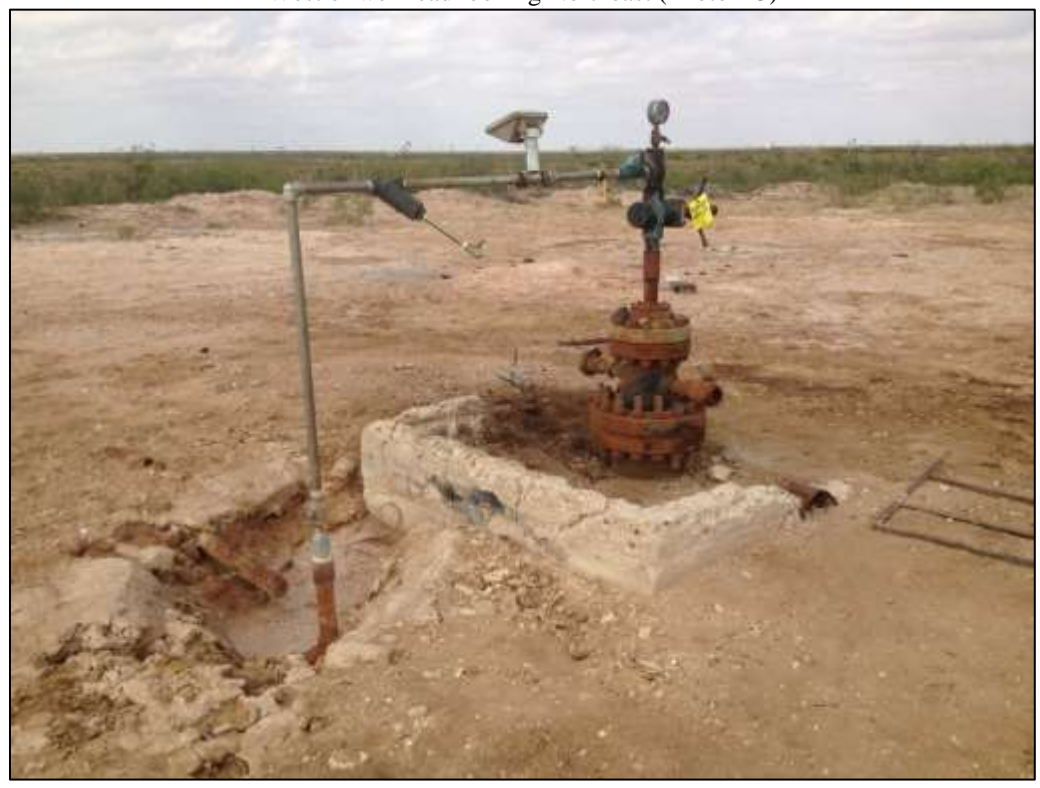
Wellhead facing Northeast (Photo # 4)