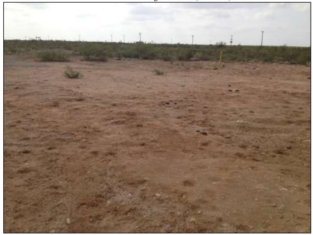
From wellhead looking Northwest (Photo # 6)