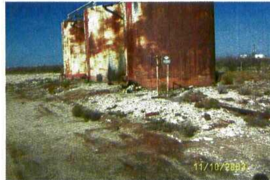
Picture # 1477- Inside battery fence. Picture taken from southwest side looking NE.