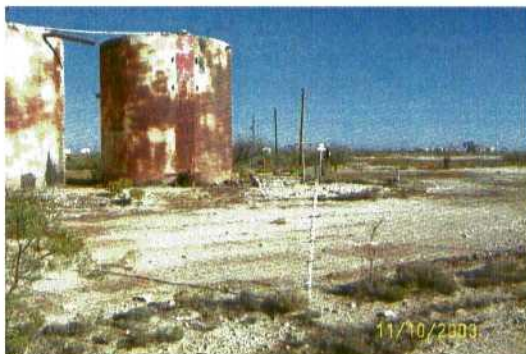
Picture # 1476-stain area inside battery fence. Picture taken from west side looking SE.