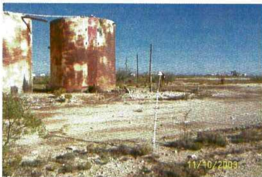
Picture # 1476- Stain area inside battery fence. Picture taken from west side looking SE.