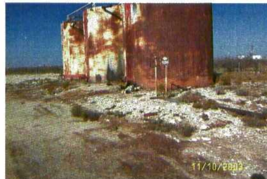
Picture # 1477- Inside battery fence. Picture taken from southwest side looking NE.