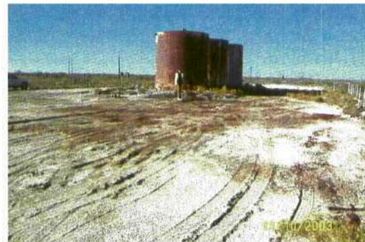
Picture # 1478- Inside battery fence. Picture taken from South West corner looking North East.