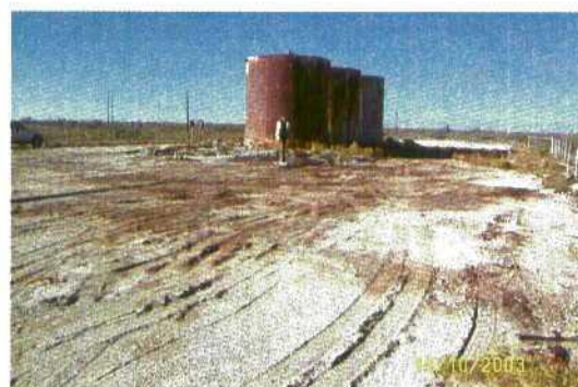
Picture # 1478- Inside battery fence. Picture taken from South West corner looking North East.