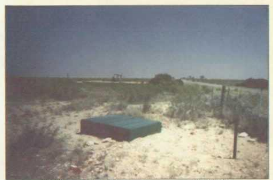
Undisturbed junction box