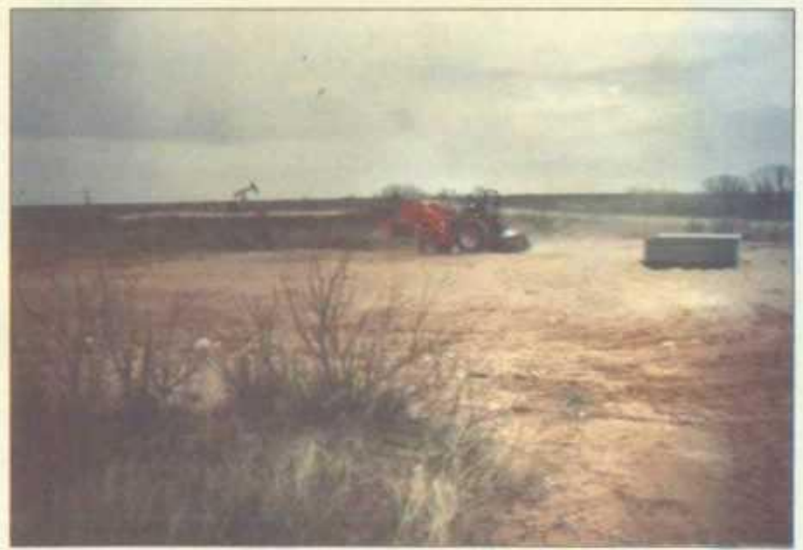
Seeding Disturbed Surface