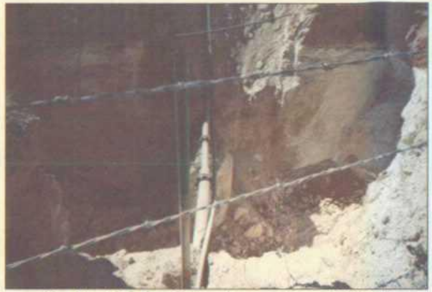
30 x 14 x 12-ft-deep Excavation