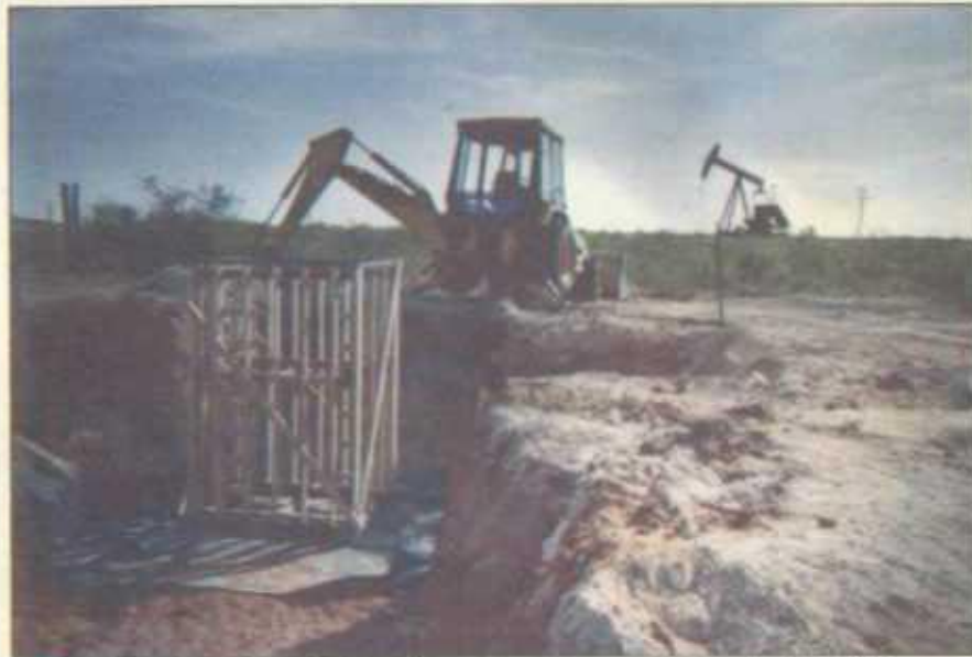
Construction of New Junction Box