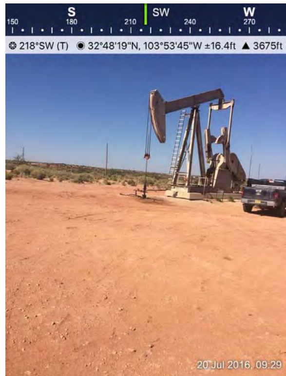
Current site photo documentation, facing southwest 7/20/2016