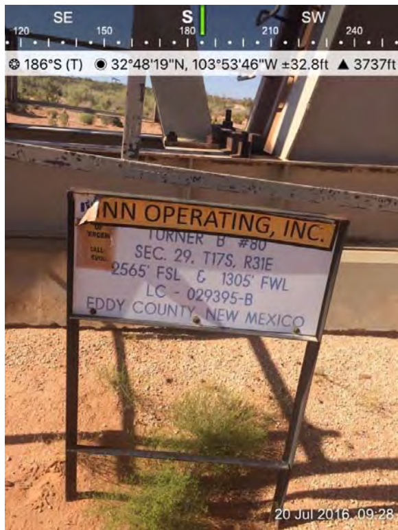
Current site photo documentation, facing south 7/20/2016