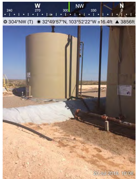
Current site photo documentation, facing west-northwest 7/20/2016