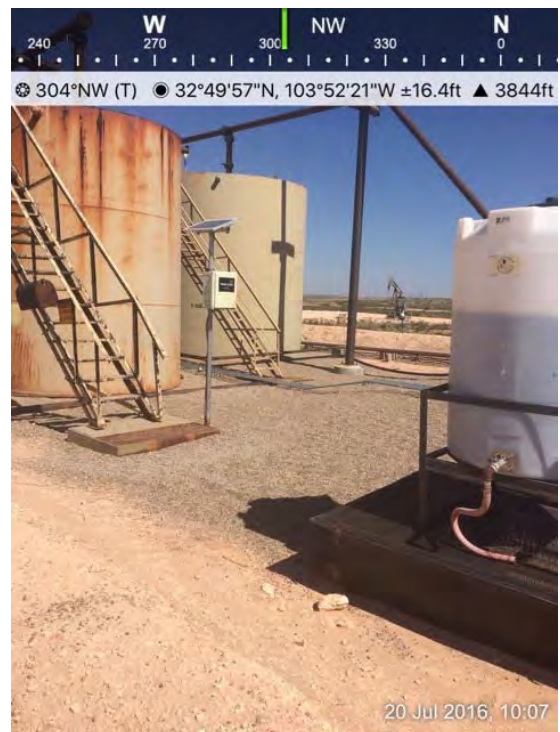
Current site photo documentation, facing west-northwest 7/20/2016