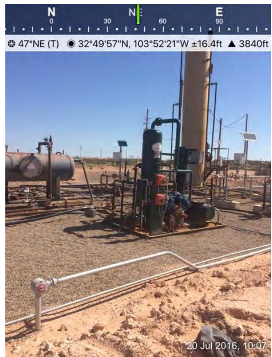
Current site photo documentation, facing northeast 7/20/2016