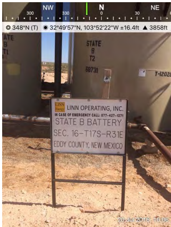
Current site photo documentation, facing northwest-north 7/20/2016