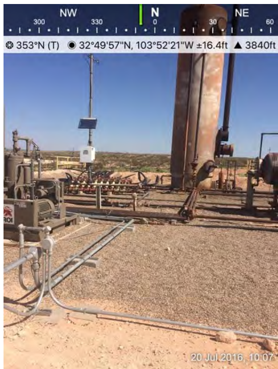
Current site photo documentation, facing north 7/20/2016