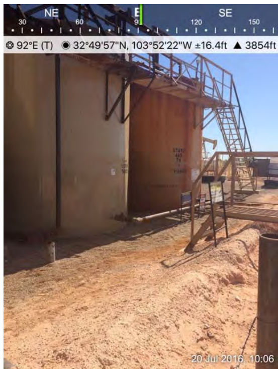
Current site photo documentation, facing east 7/20/2016