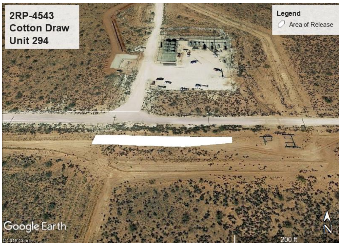
Figure 2: Area of Release at Cotton Draw Unit 294 – 209 bbls with 50 bbls recovered.