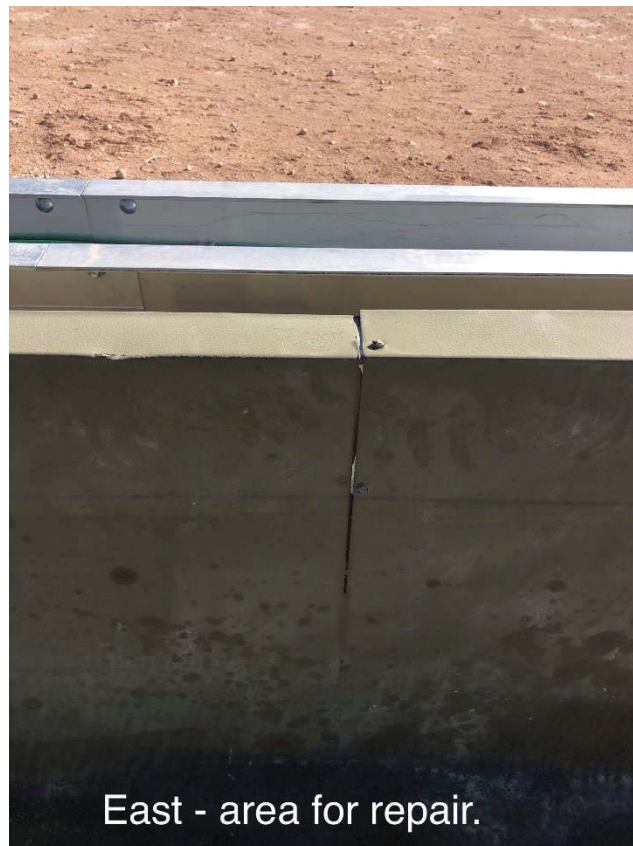
East - area for repair.

Safely serving the best companies with unmatched quality and service