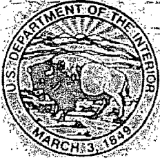
EXHIBIT NO. 1