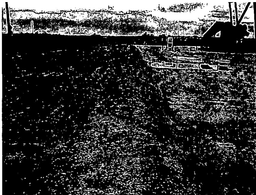
EAST EDGE OF WELL PAD FACING SOUTH RIPED ACROSS SLOPE AND BERMED