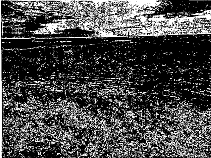
SOUTH EDGE OF WELL PAD AND STINGER. CUT PUT COMPLETELY TO BED AND CONTOURED PERFECTLY.