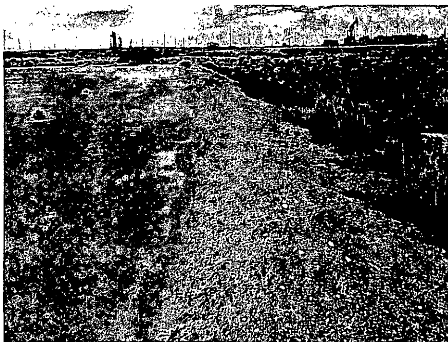
.NORTH SIDE BERMED

REMAINING SURFACE NEEDED FOR DAILY OPERATIONS IS 166' X 185' (0.71ac).