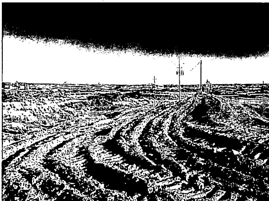
IR on west with berm between IR and pad.

Remaining surface needed for daily operations is 204' x 200' or 0.93 acres.