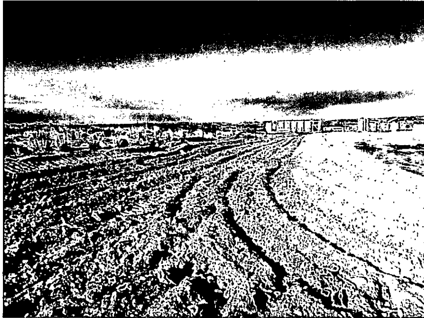
IR on south with berm between IR and pad.