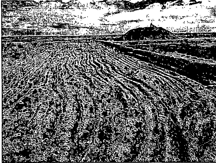
NORTH EDGE OF WELL PAD