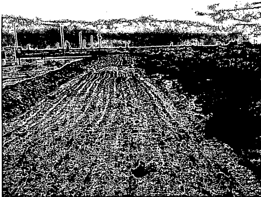
WEST EDGE OF WELL PAD. BERMED AND SEEDED

REMAINING SURFACE NEEDED FOR DAILY OPERATIONS IS 182' X 191' (0.80ac).