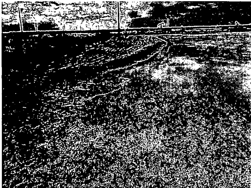
SOUTH EDGE SHOWING GREATER THAN 3:1 SLOPE AND RECLAIMED CALICHE PIT IN BACKGROUND; BROUGHT BACK TO 65' FROM WELLHEAD