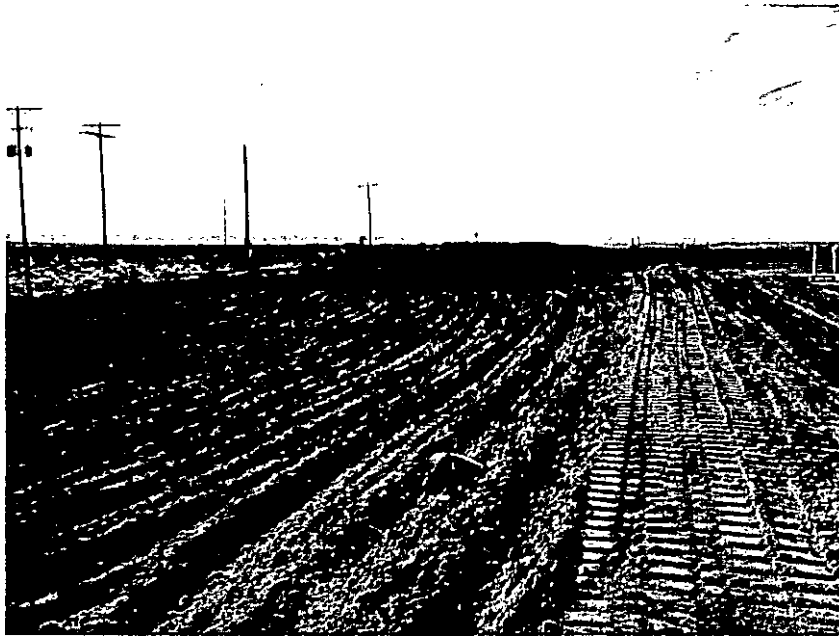
IR on south side of well pad with berm