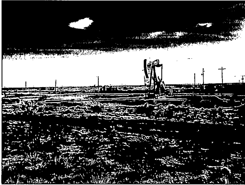
Overview of well pad

AAO FEDERAL #18; Sec.1, T18S, R27E; 2310' FNL & 1650' FEL; 30-015-42035; NMNM-0557371