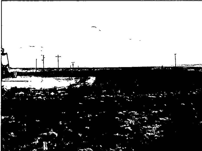
IR on west side of well pad.

Remaining surface needed for daily operations is 209' x 134' or 0.64 acres.