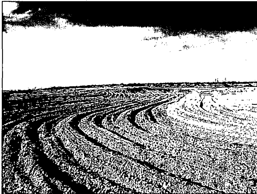
IR on west side of well pad with berm