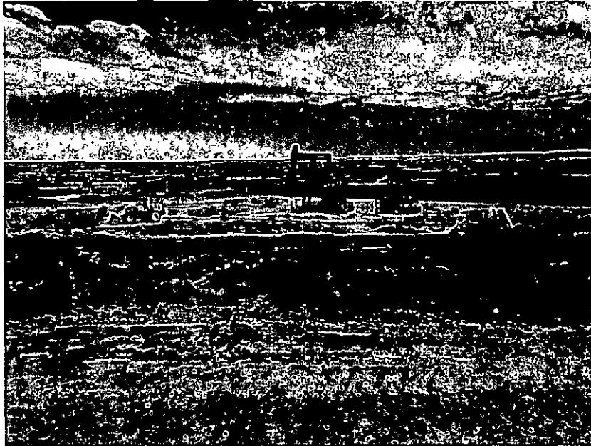
OVERVIEW OF WELL PAD

LEE FEDERAL #78; S.18,T17S,R31E; 2125FSL & 2345 FEL; 30-015-42189; NMLC-029395B