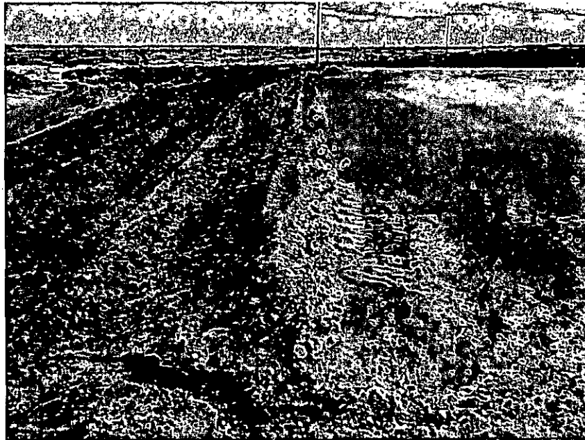
WEST EDGE OF WELL PAD RUNNING ALONG THE WELL PAD WITH GREATER THAN 3:1 SLOPE RIPPED IN SEEDED.