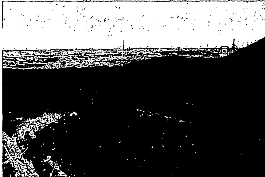
West side of well pad showing IR and berming between IR and well pad.