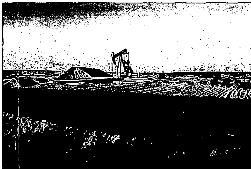
North side of well pad showing IR area and berm between well pad and IR.