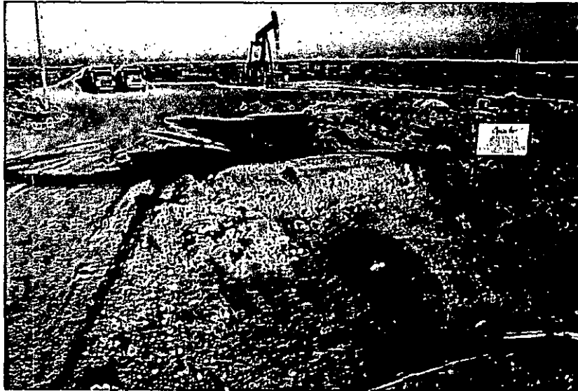
Overview of well pad at entrance on SE corner

LEE FEDERAL #79; L. Sec. 20, T17S, R31E; 1710' FSL & 330' FWL; 30-015-42190; NMLC-029395B