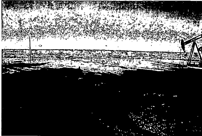
SOUTH EDGE OF WELL PAD