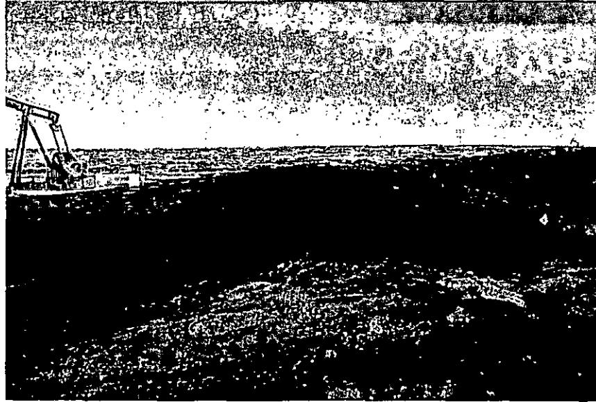
EAST EDGE OF WELL PAD FACING NORTH WITH GREATER THAN 3:1 SLOPE