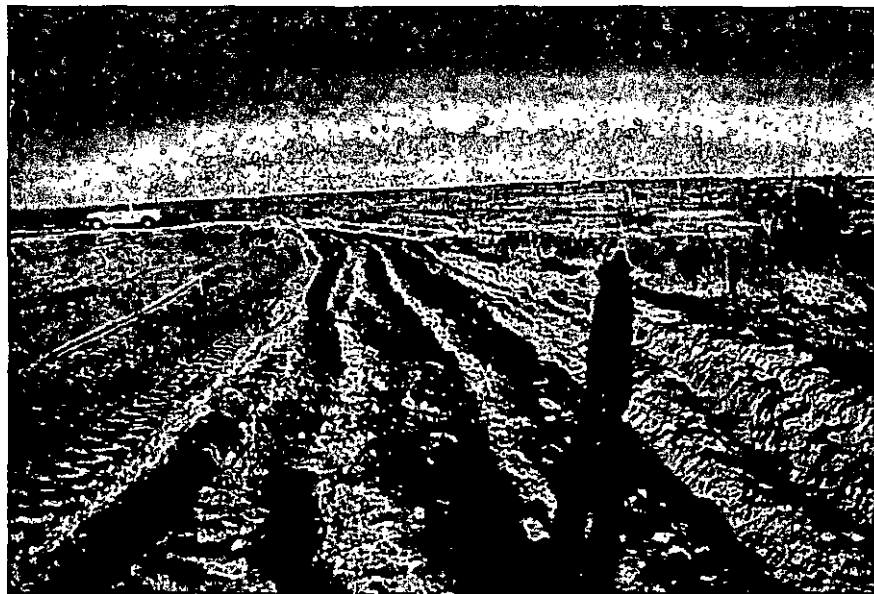
NORTH EDGE OF WELL PAD FACING WEST LEADING TO ENTRANCE.

REMAINING SURFACE NEEDED FOR DAILY OPERATIONS IS 200' X 180' (0.83ac).