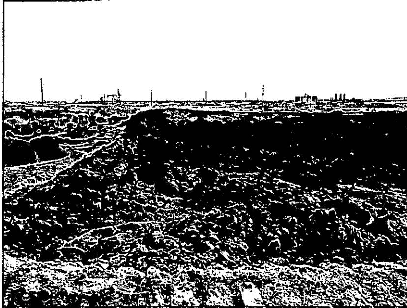
EAST SIDE OF WELL PAD ON NORTH

LOCO FEDERAL #8; G.Sec.21,T17S,R30E; 2310' FNL & 1650' FEL; 30-015-40616 ; NMNM-106331