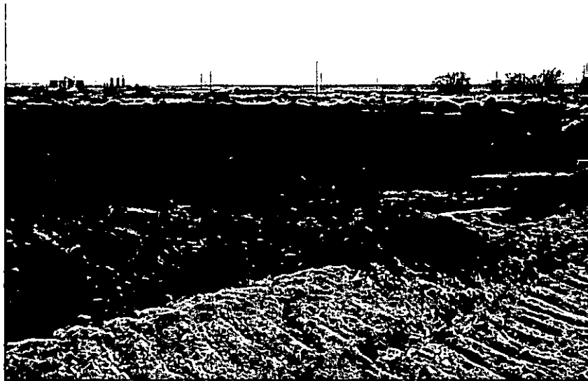
EAST SIDE OF WELL PAD TO SOUTH