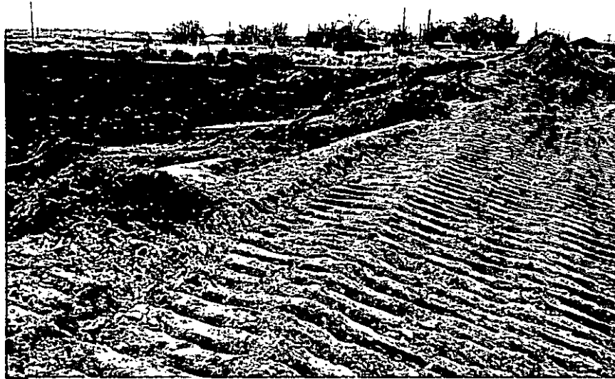
BERMING BETWEEN WELL PAD AND IR

REMAINING SURFACE NEEDED FOR DAILY OPERATIONS IS 200' X 147' OR 0.67 ACRES.