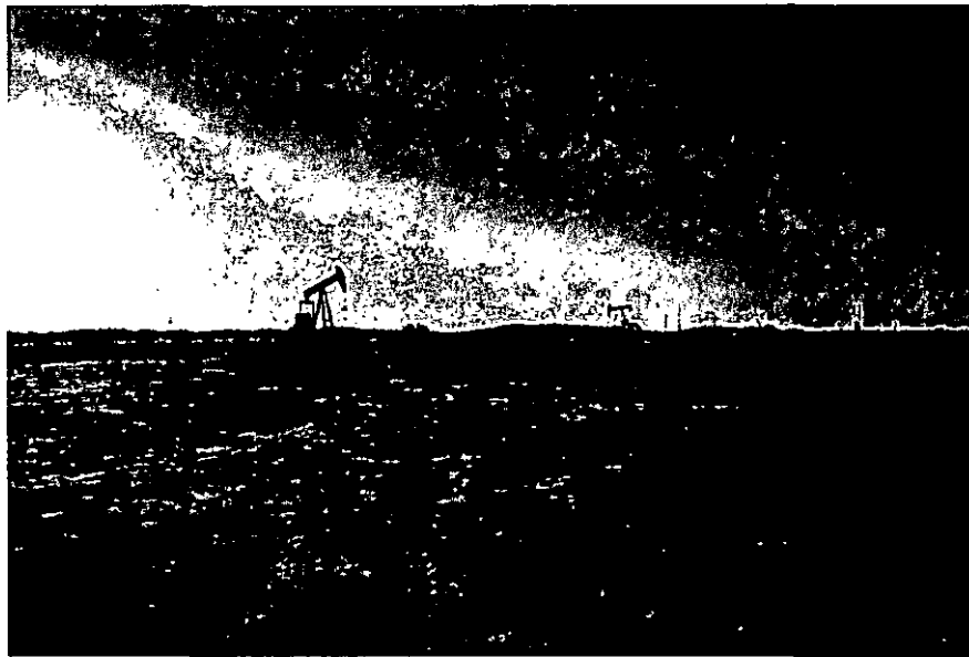
SOUTH AREA BETWEEN APACHE AND LINN WELL. SAND DUNE REPLACED TO RESTORE NATURAL LANDSCAPE.