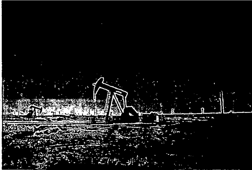
OVERVIEW OF WELL PAD

TONY FEDERAL 48; S.18,T17S,R31E; 1650' FSL & 800' FWL; 30-015-41989; NMLC-029395A