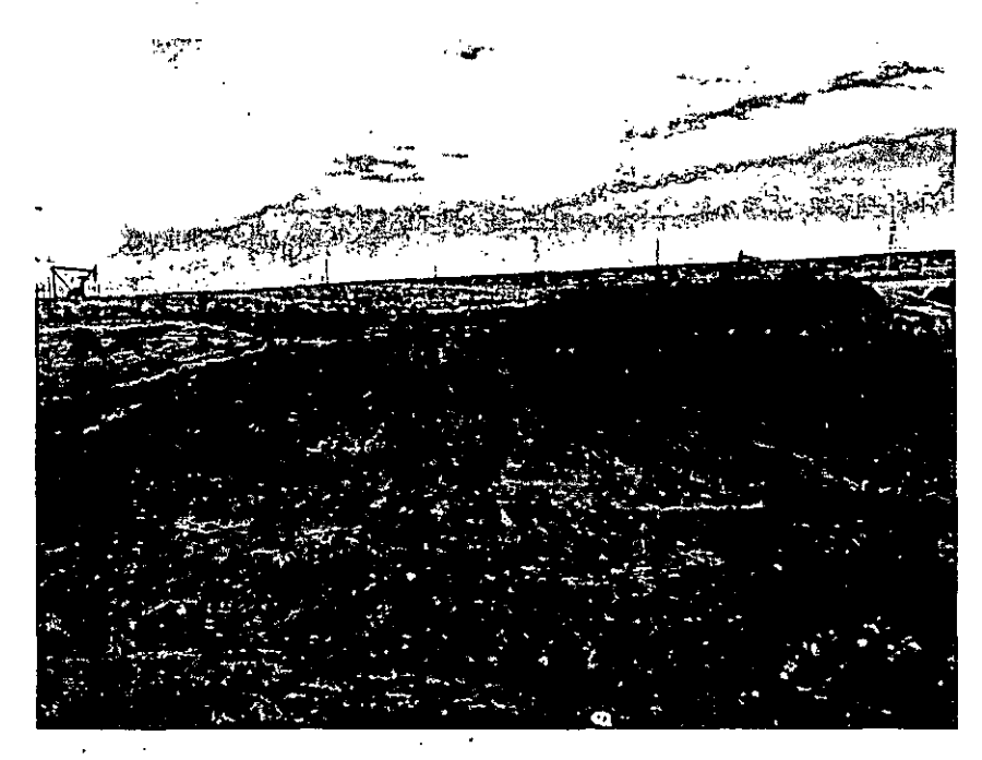
RECLAMATION ON NORTH WITH GREATER THAN 3:1. RIPS ACROSS THE SLOPE. WELL PAD TAPERS BACK INTO THE CUT TO PREVENT EROSION ON DOWNSLOPE.