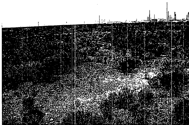
Photo of West Artesia Grayburg Unit 24, showing production as of May 2005.