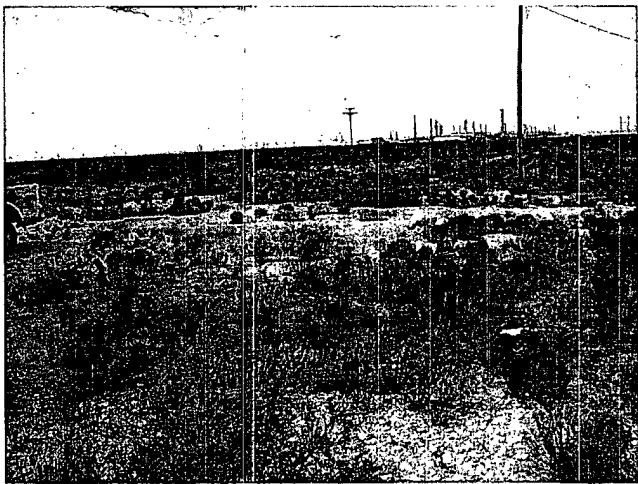
Photo of West Artesia Grayburg Unit 22, showing production as of May 2005.

Subject: Hanson Energy, West Grayburg Units 16, 22, 24