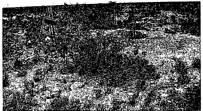
Photo of West Artesia Grayburg Unit 16, showing production as of May 2005.