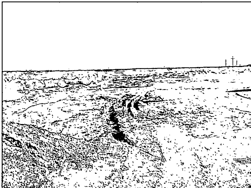
IR on north with some stockpiled caliche remaining in nw corner

Remaining surface needed for daily operations is 199' x 167' or 0.76 acres.