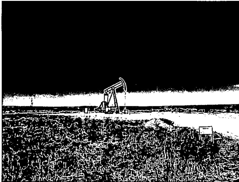
Overview of well pad

Raven Federal #1; Sec.7, T17S, R31E; 2190' FSL & 990' FWL; 30-015-40465 ; NMLC-029435A