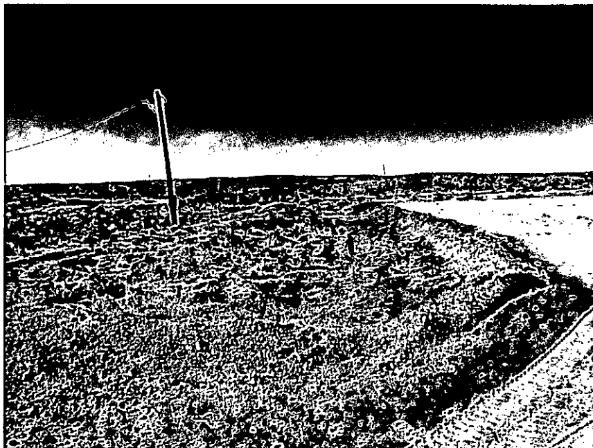
IR on south side with berm at pad. Vegetation is establishing.