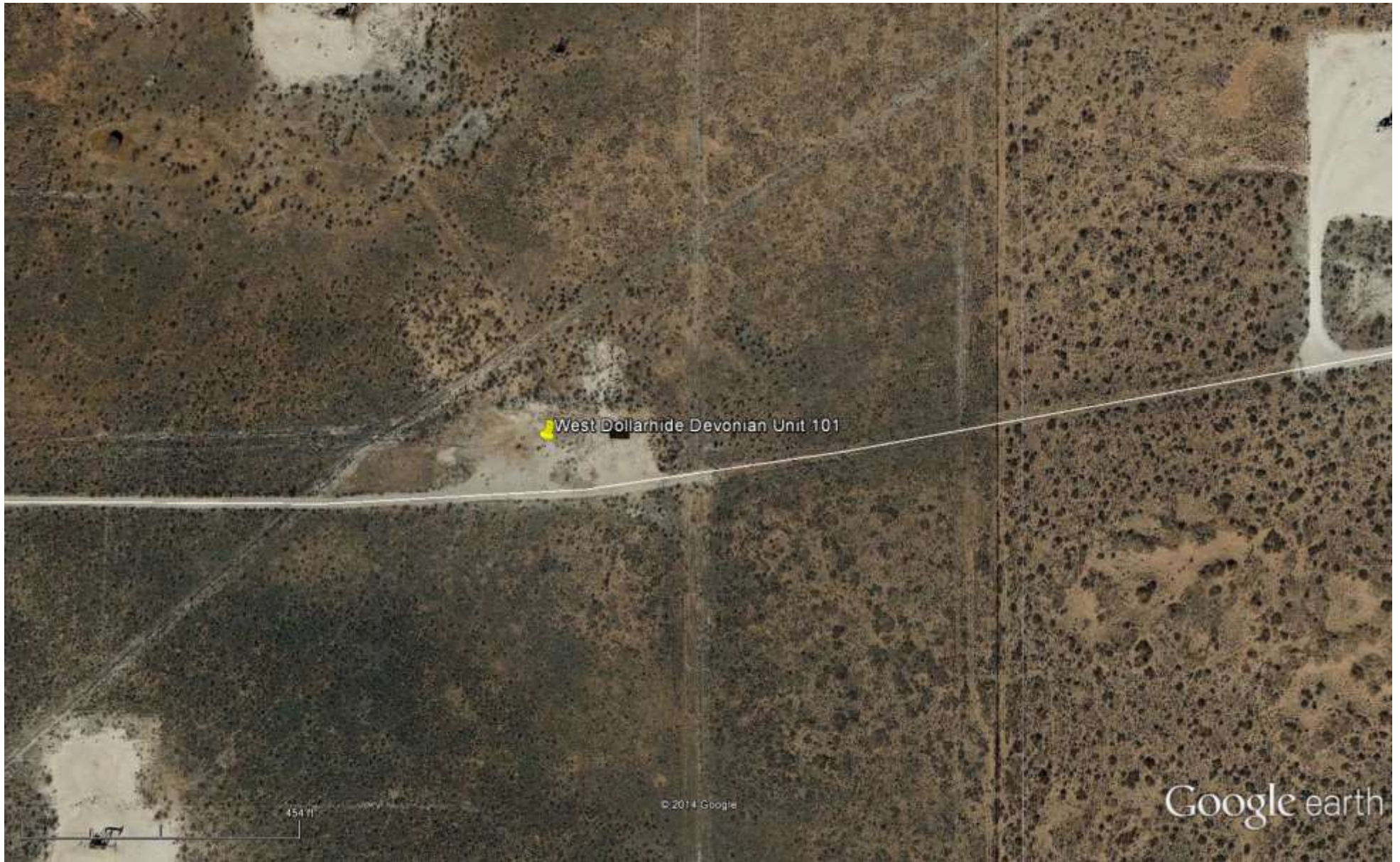
West Dollarhide Devonian Unit 101