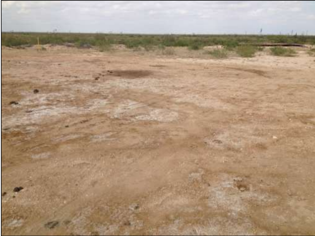
West of wellhead looking Northeast (Photo # 1)