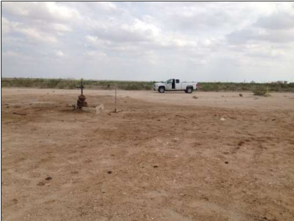
From North of wellhead looking South (Photo #8)