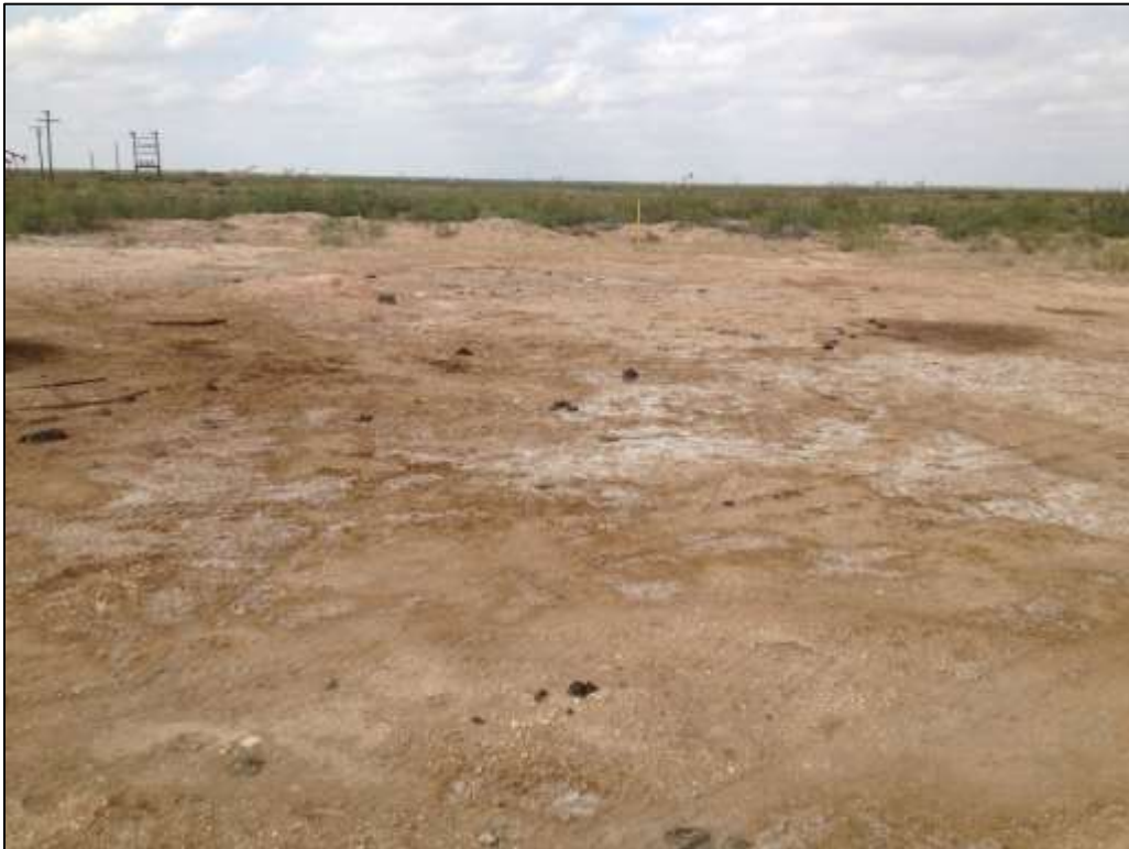
West of wellhead looking Northeast (Photo # 2)