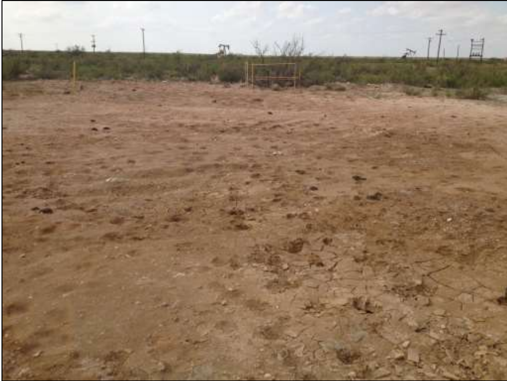
From wellhead looking Northwest (Photo # 5)