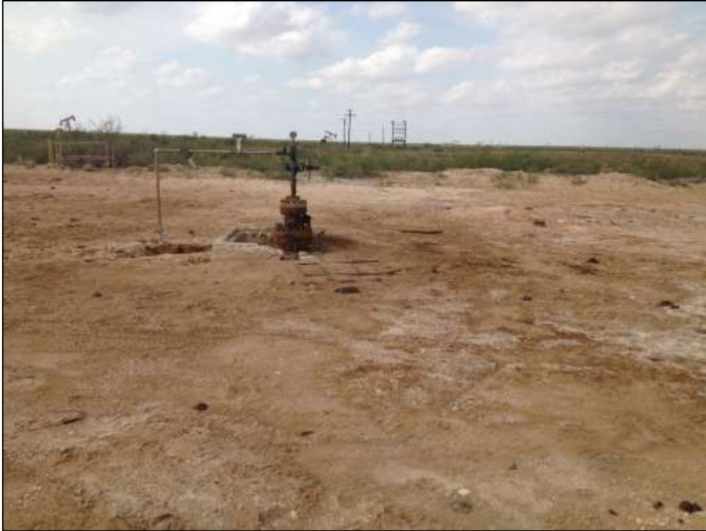
West of wellhead looking Northeast (Photo # 3)