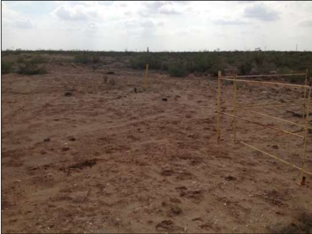
From North of wellhead looking West (Photo #7)