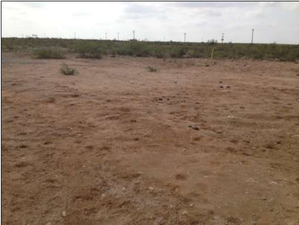
From wellhead looking Northwest (Photo # 6)