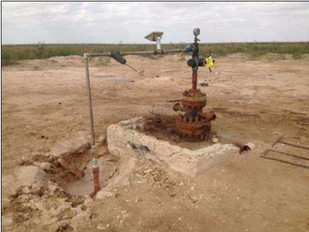
Wellhead facing Northeast (Photo # 4)