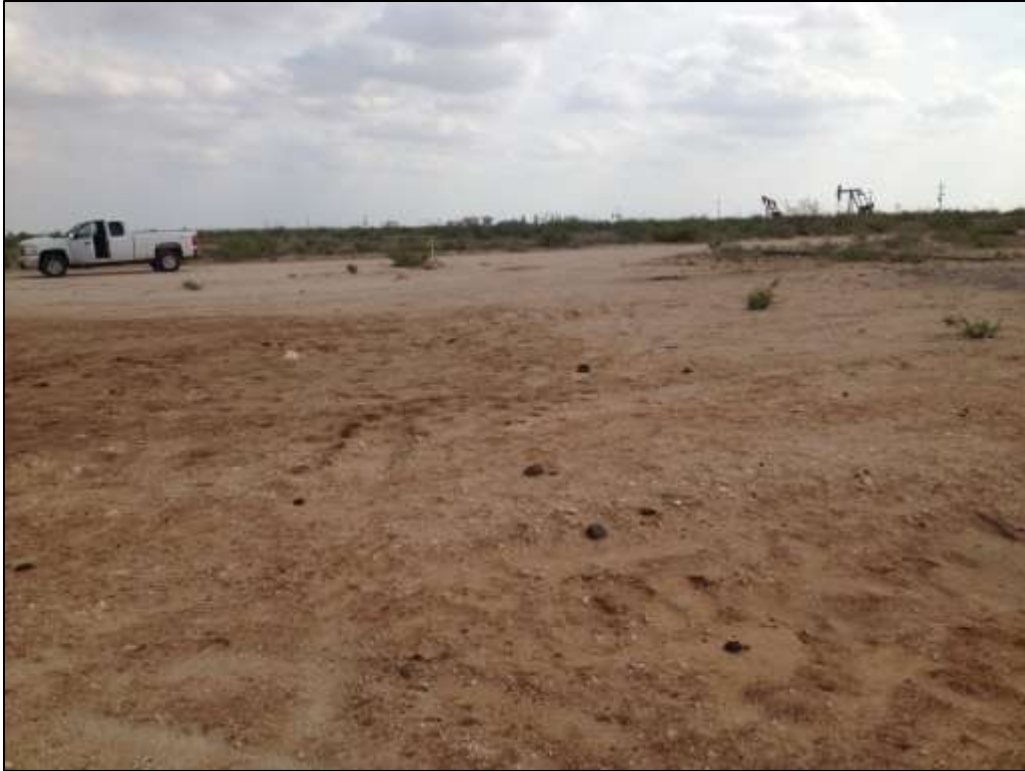
From North of wellhead looking Southwest (Photo #9)