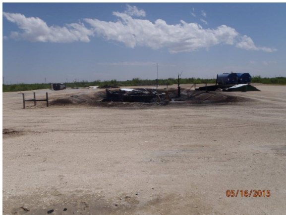
EME K-33 SWD, facing south 5/16/2015