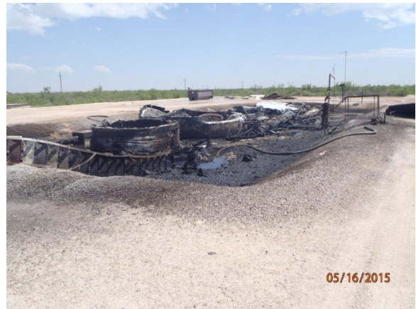
EME K-33 SWD, facing southeast 5/16/2015