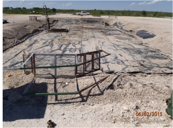
Site, facing north