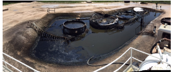
All produced water contained within the berm 5/16/2015