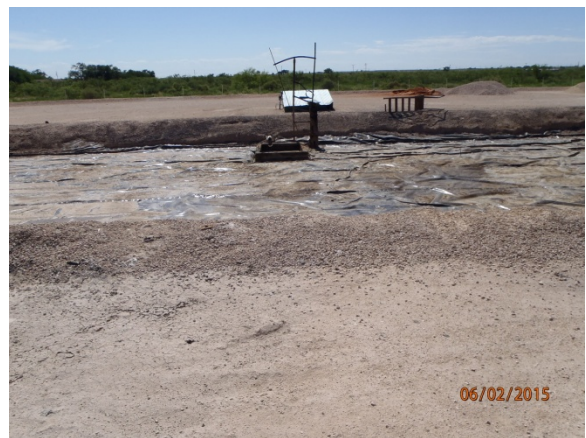
Site, facing west