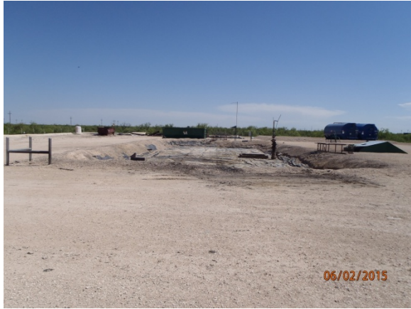
Site, facing south