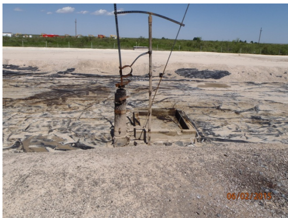
Site, facing east