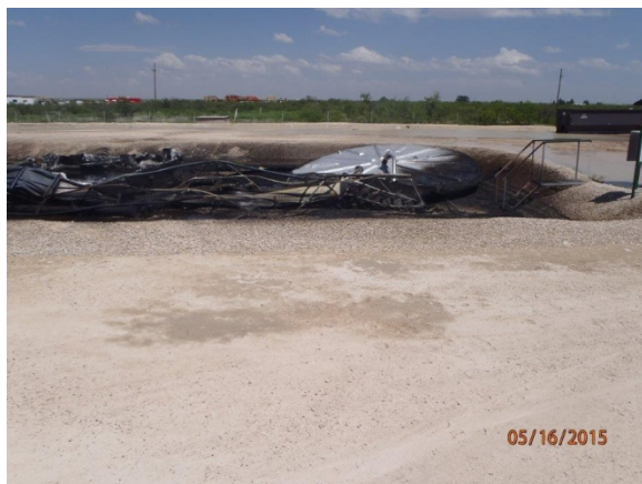
EME K-33 SWD, facing east 5/16/2015