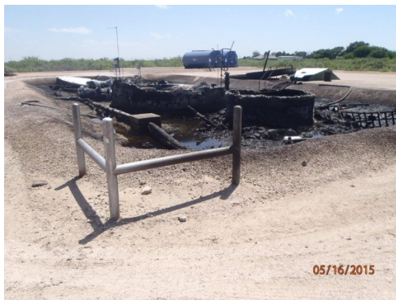
EME K-33 SWD, facing southwest 5/16/2015