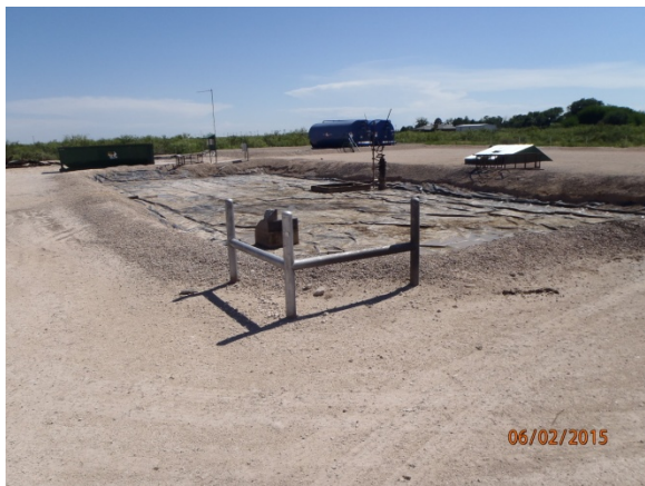
Site, facing southwest