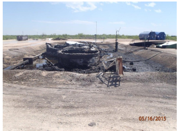
EME K-33 SWD, facing south 5/16/2015