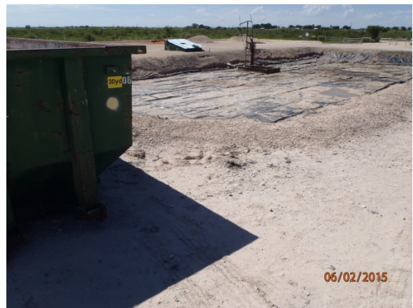
Site, facing northwest