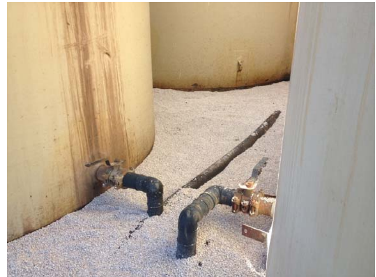
Pic 3. Tank battery internal view after clean-up