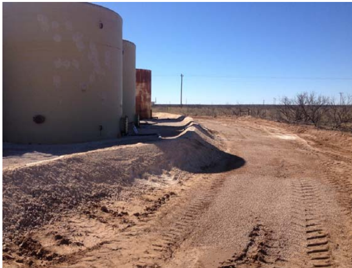
Pic 2. Side view tank battery after clean-up