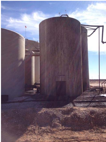
Pic 1. Gunbarrel Tank at the moment of the released