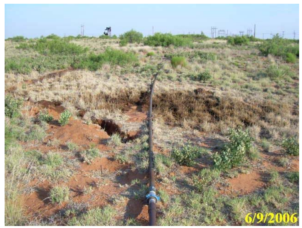
Photo #1 - Looking northeasterly across point of release and overspray area