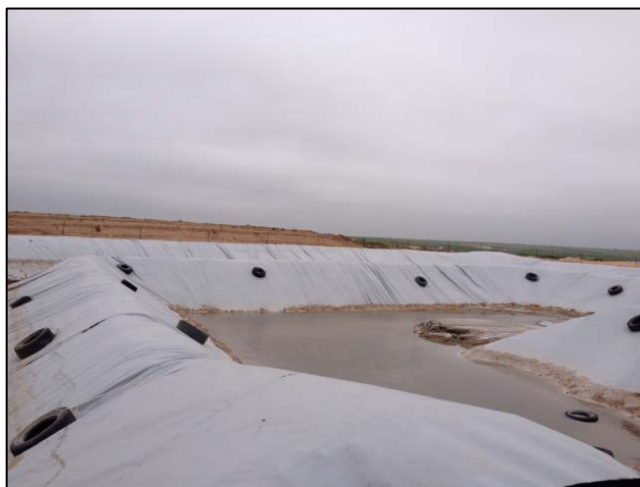
Current liner condition on 5/20/2015; rainwater in pit from previous day

Copy: Murchison Oil and Gas, NM State Land Office (Ed Martin)