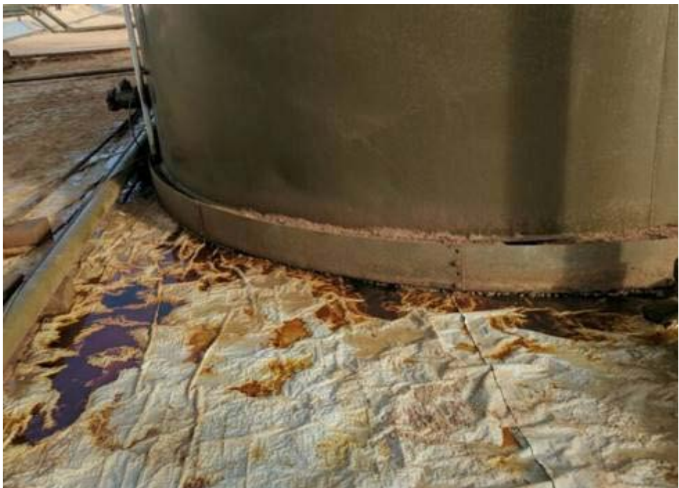
Post clean up