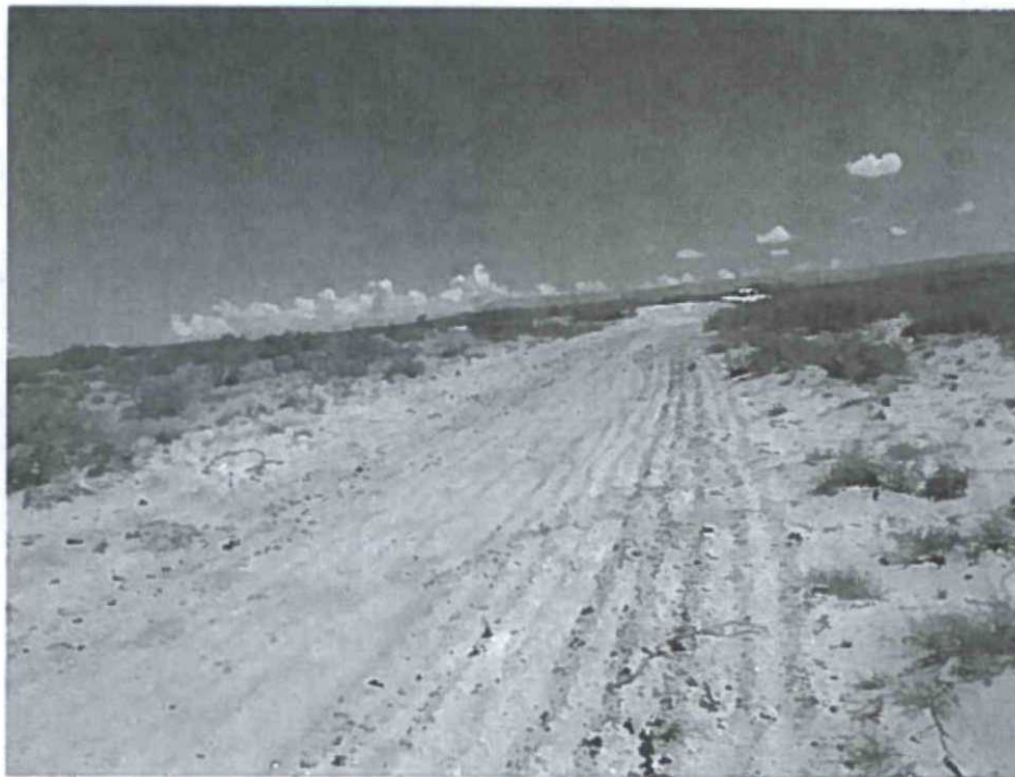
Former lease road after seeding 8/23/13