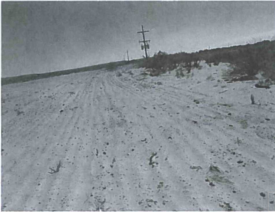
Site post seeding 8/23/13