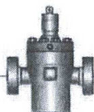
2" Manual Valve