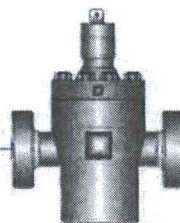
4" Manual Valve