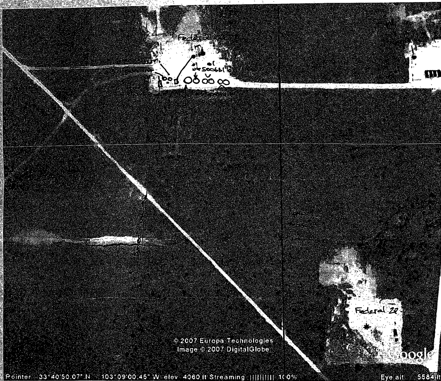
Facility Diagram for Federal 28-3