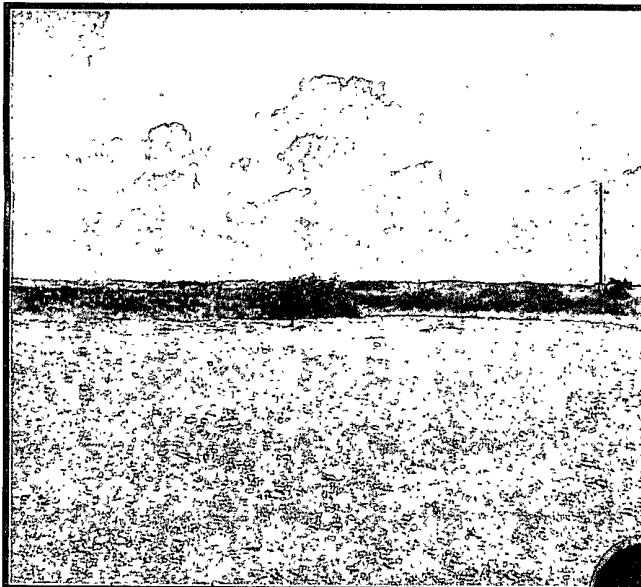
Exxon Federal Tank Battery and Well No. 1

The pictures below were taken on August 13, 2008. A picture of Exxon Federal Well No. 4 is not available.