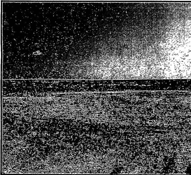
Exxon Federal Well No. 3 Location

The pictures below were taken on August 13, 2008. A picture of Exxon Federal Well No. 4 is not available.