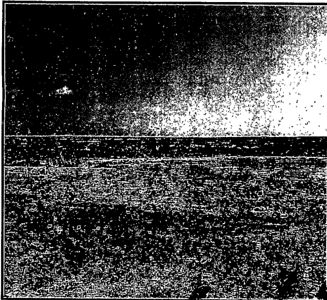
Exxon Federal Well No. 3 Location

The pictures below were taken on August 13, 2008. A picture of Exxon Federal Well No. 4 is not available.