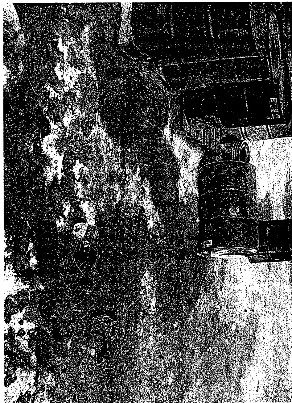
PRIDE INBE 13-2