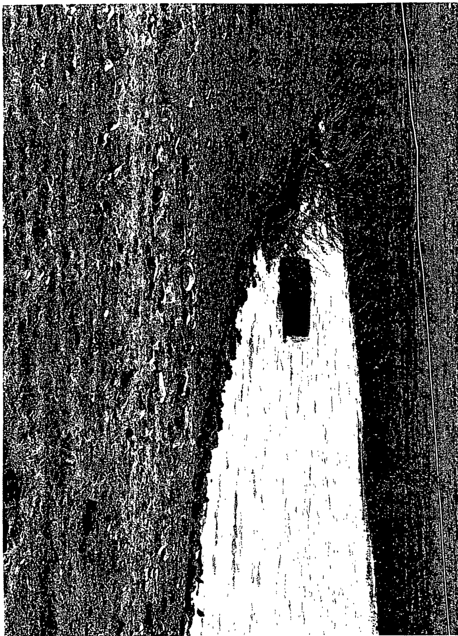
POND NE OF WELL PLASTIC DRUM FROM LOC.