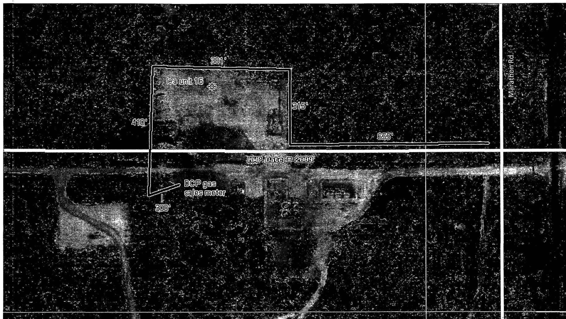
Proposed Gas Pipeline NW/4 SW/4 Section 12, T20S, 34E Lea County, NM