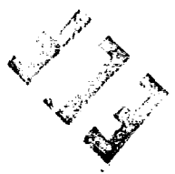
Figure 1. Schematic representation of the experimental design. The subjects were divided into two groups: the control group and the experimental group. The control group was divided into two subgroups: the control group and the control group. The experimental group was divided into two subgroups: the experimental group and the experimental group. The control group was divided into two subgroups: the control group and the control group. The experimental group was divided into two subgroups: the experimental group and the experimental group.